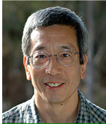
Professor Roger Tsien UC San Diego

Distinguished Science and Technology Award